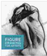
Figure Drawing for Artists by Steve Huston