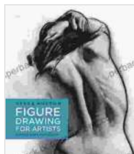
Figure Drawing for Artists by Steve Huston

figure drawing. Through his insightful teachings, you will delve into the intricacies of capturing the human form, translating emotions through gestures, and conveying the essence of life in your art.