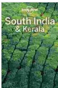
Image Alt Text: Aerial view of a traditional village amidst lush greenery in South India.