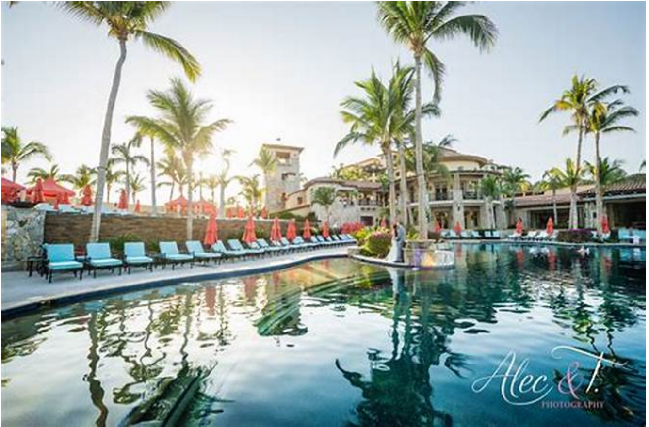
Private pool at Hacienda Beach Club & Residences in Los Cabos