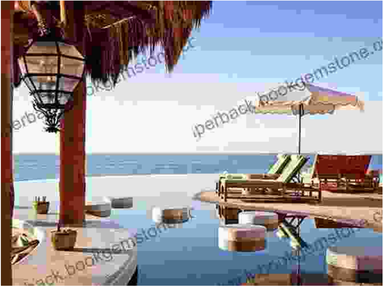
Zen Pool at The Resort at Pedregal in Los Cabos